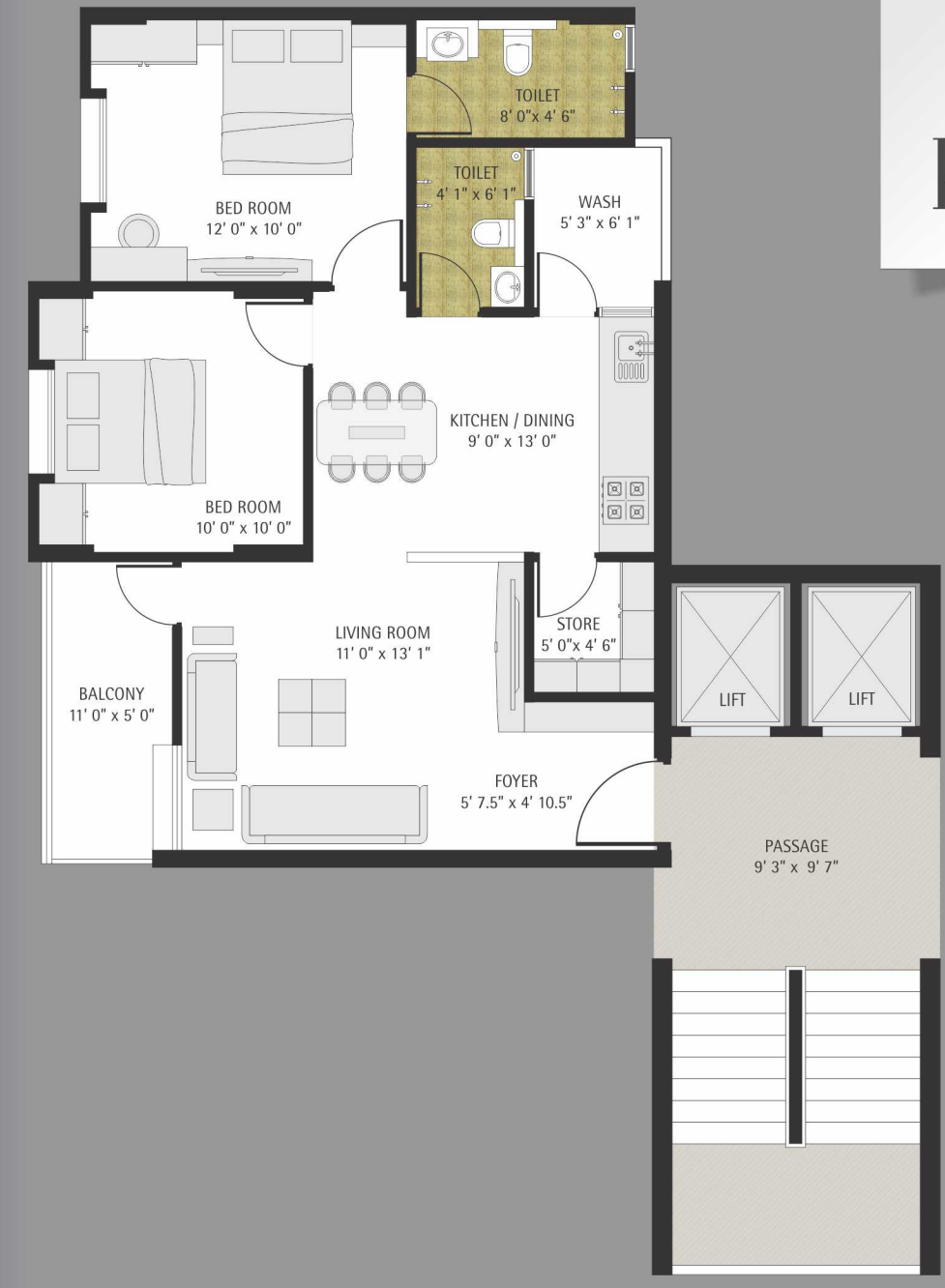
Typical Floor Plans - 2 Bhk