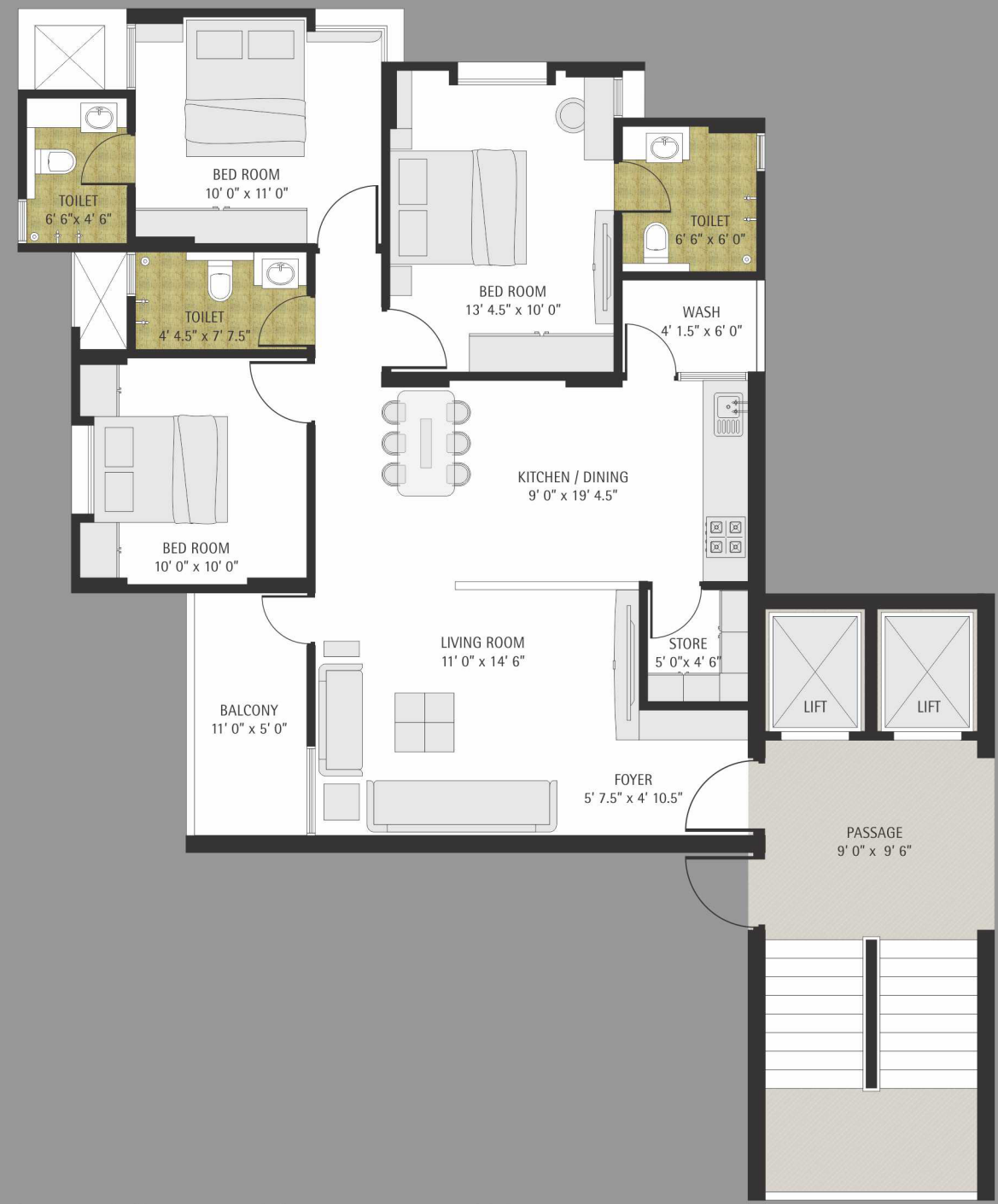
Typical Floor Plans - 3 Bhk